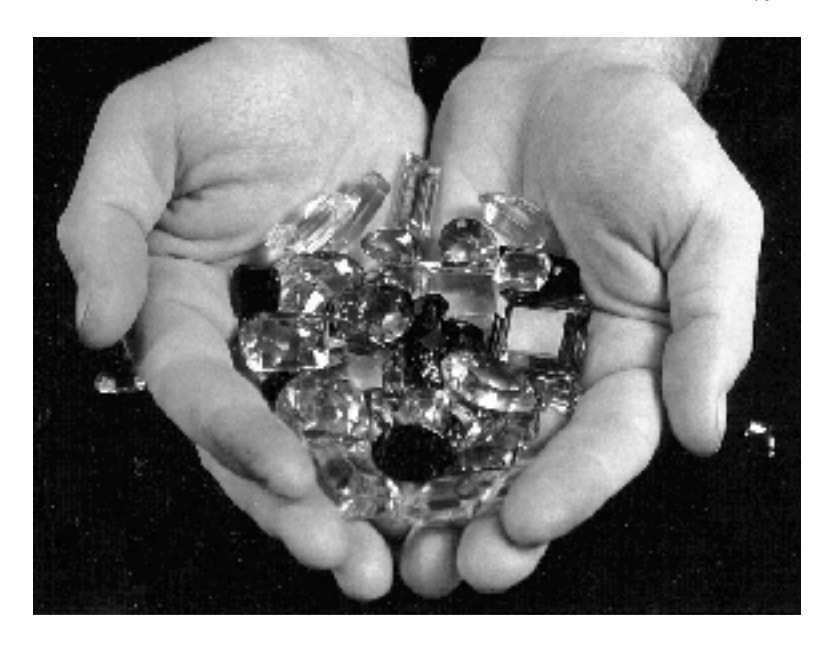
If you are a gemologist, then the eternal New Jerusalem will be your dream come true!