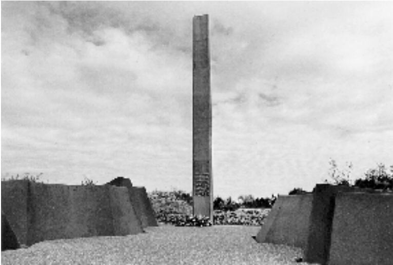
A memorial for the victims of the Holocaust, at Yad VaShem, in Jerusalem, Israel.