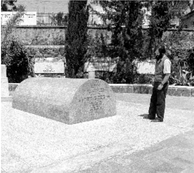
The tomb of Rambam.

depart from me...ye cursed into everlasting fire” (Matt. 7:23; 25:41 KJV). 23