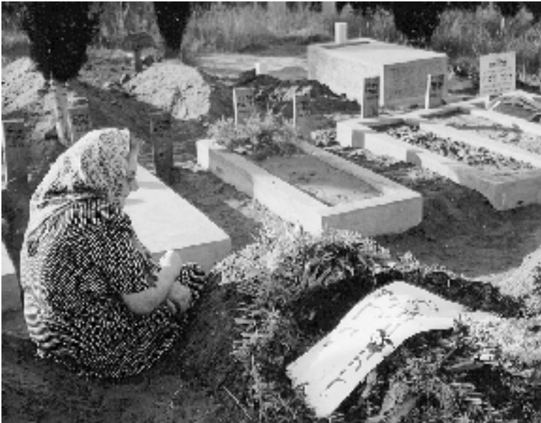
An Israeli mother weeps over the grave of her eighteen-year-old son, killed in battle. This picture clearly illustrates that if there is no resurrection, as liberals teach, then we live in utter hopelessness. This picture helps us appreciate the promises the Bible gives us concerning resurrection.