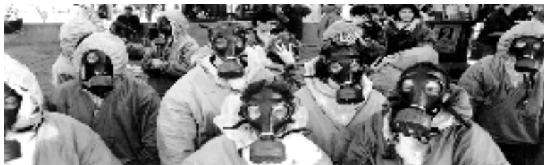
The Israelis were well prepared in the Gulf War, and we pray that they will also be on guard for the last war.

"SONG OF SOLOMON....VIII. 4. 'I charge you, O daughter of Jerusalem.' Targum : King Messiah shall say, I adjure you, O my people of the house of Israel, wherefore do ye contend against the people of the land, (desiring) to go out of captivity? And wherefore do ye rise up against the army of Gog and Magog? Tarry ye a little, till the people be consumed who have gone up to wage war against Jerusalem, and afterwards the Lord of the world will remember unto you the mercies of the righteous, and it shall be pleasure before him to redeem you." 13 "In the End of Days, Gog and Magog and their armies will fall into the hands of King Messiah, and for seven years the Children of Israel will light fire from the shares of their weapons; they will not go out to the forest and will not cut down a [single] tree... (Targ. Yer. to Num. 11:26)." 14