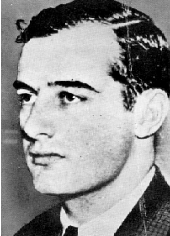
Portrait of Raoul Wallenberg.