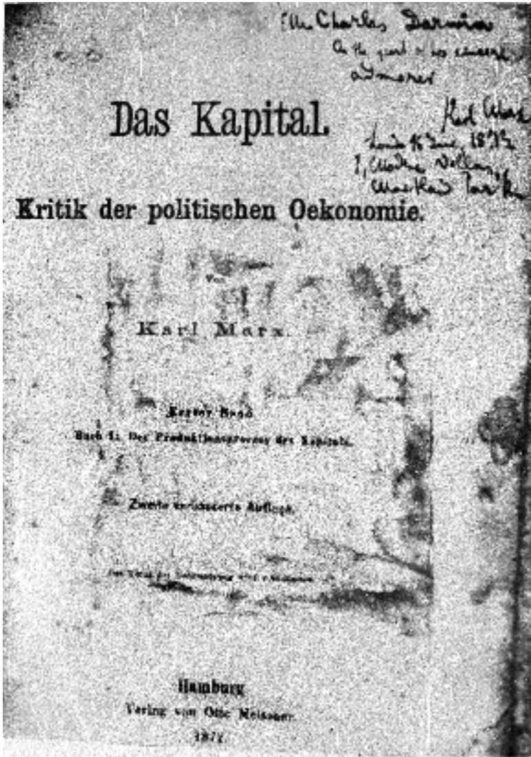
The second edition of Das Kapital , personally inscribed by Marx to Darwin. Darwin turned down Marx's offer to dedicate the book to him due to his wife's objections; she was of Judeo-Christian background.