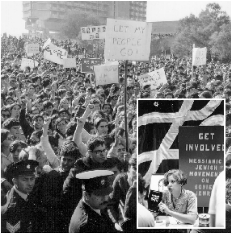
Israeli demonstration in Jerusalem, supporting the immigration of Russian Jews to Israel.