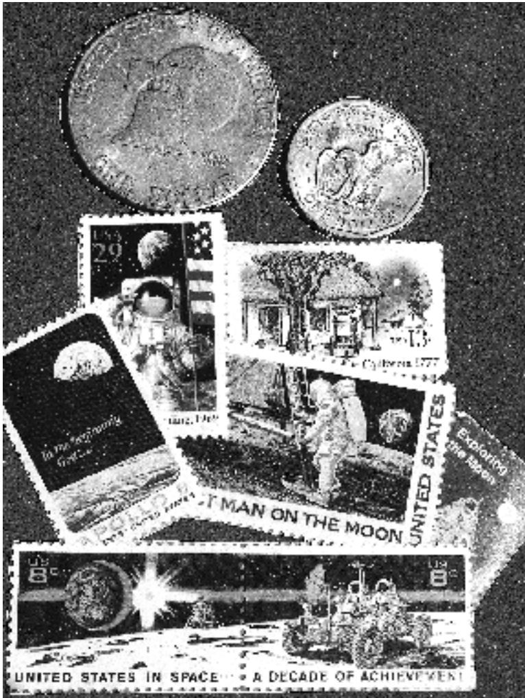
U.S. postage stamps commemorating the exploration of the moon.